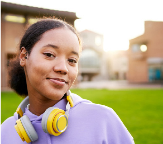
Client name changed to protect confidentiality. Photo is a stock image.

Aubrey’s success is a testament to her resilience and the hope that comes with access to mental health care for children and young adults.